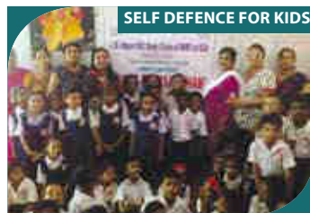
SELF DEFENCE FOR KIDS