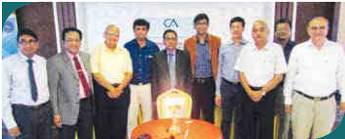
Vapi: Group photograph taken during the 6th RRC at Silvassa held on 27 & 28/6/2015