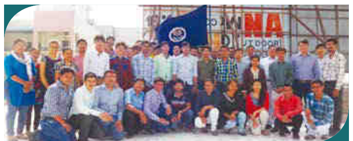
Jamnagar: Group photograph taken during the CA. Day Celebration on 1st July, 2015