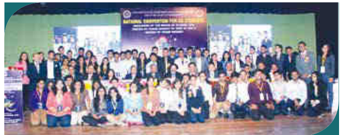
Thane: Group photograph taken during the National Convention for CA Students