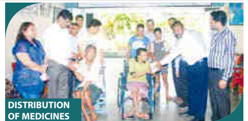
DISTRIBUTION OF MEDICINES