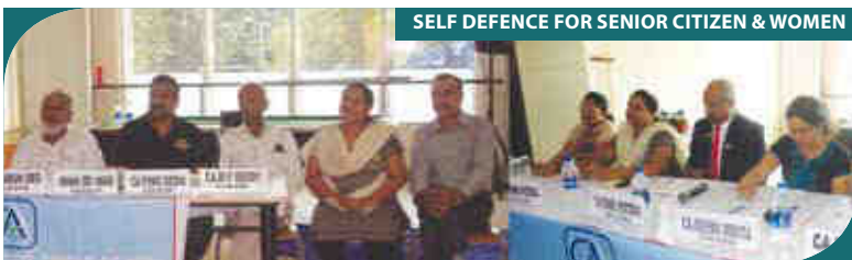
SELF DEFENCE FOR SENIOR CITIZEN & WOMEN