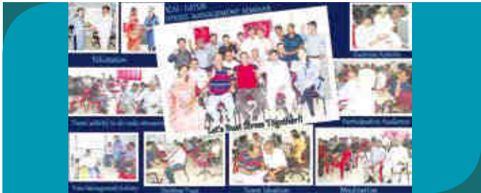
Latur: Group photo taken during the Seminar on Stress Management