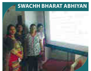
SWACHH BHARAT ABHIYAN