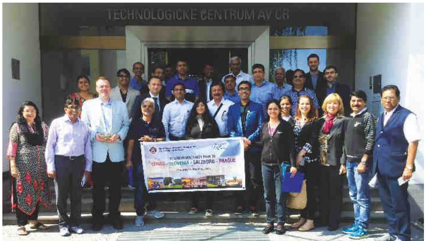
Interactive Meeting with Czech Republic Technology Institute & Chamber of Accountants in Prague