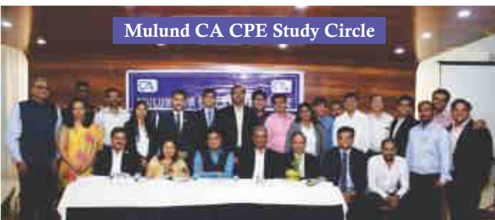
Mulund CA CPE Study Circle