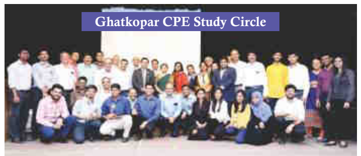
Ghatkopar CPE Study Circle