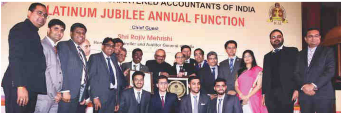
BEST STUDENTS ASSOCIATION (WICASA)