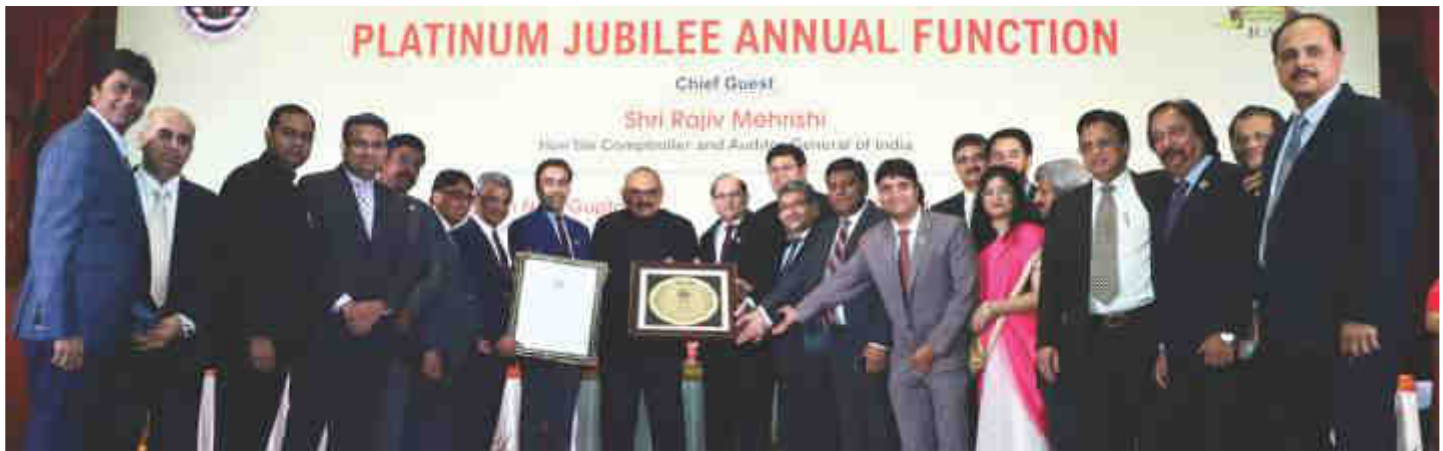
BEST REGIONAL COUNCIL (WIRC)